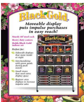
Western Region Black Gold Rolling Rack Sell Sheet

Soils & Boxed Fertilizer Indoor Set Rolling Display Rack Info & Program