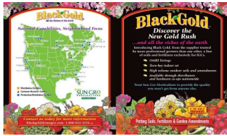
Black Gold Trade Brochure

"Discover the New Gold Rush" Black Gold introduction 100 per packet