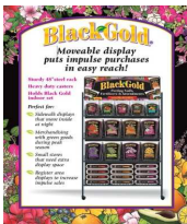
National Black Gold Rolling Rack Sell Sheet

Soils & Fertilizer Indoor Set Rolling Display Rack Info & Program 100 per packet