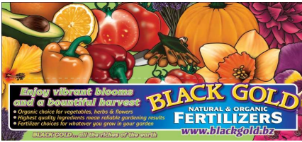
Black Gold Fertilizer Shelf Talker

Shelf Talker is 11" wide by 5.5" tall Fertilizer Product Line Clear plastic covered cardstock