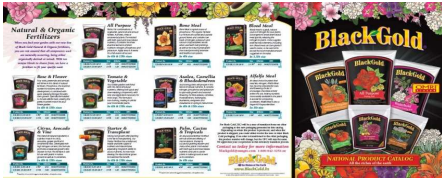
Black Gold National Catalog

Potting Soils Amendments Fertilizers 50 per packet