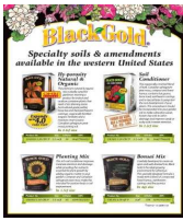
Black Gold Western Region Brochure

Specialty Soils Amendments Western Region availability