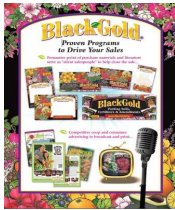
Black Gold Marketing Sell Sheet

Proven Programs to Drive Your Sales 100 per packet