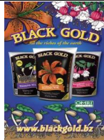
Black Gold Poster

Contains Pictures of: Black Gold Natural & Organic Black Gold Waterhold Cocoblend Black Gold Seedling Mix