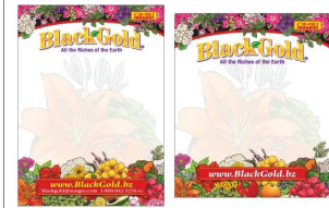
Black Gold Notepads