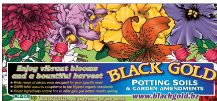
Black Gold Potting Soil Shelf Talker

Shelf Talker is 11" wide by 5.5" tall Potting Soil Product Line Clear plastic covered cardstock